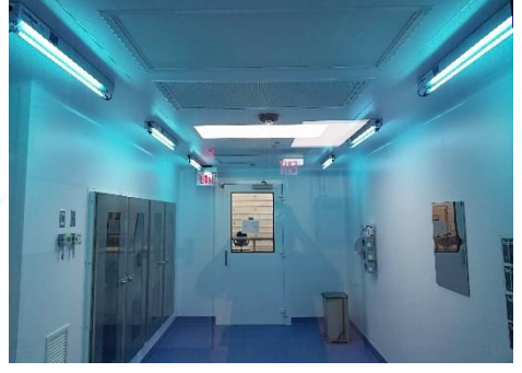
Room / Surface Disinfection (unoccupied)

Fresh-Aire UV systems are installed within the HVAC system and are not intended to diagnose, treat, prevent or cure any disease. The systems have not been tested on coronavirus and is not a medical device.