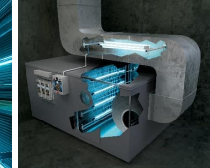
Air Handler Disinfection