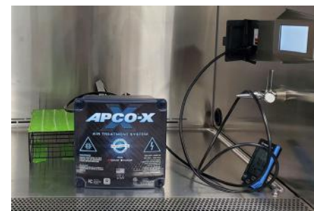
APCO-X™ in test chamber